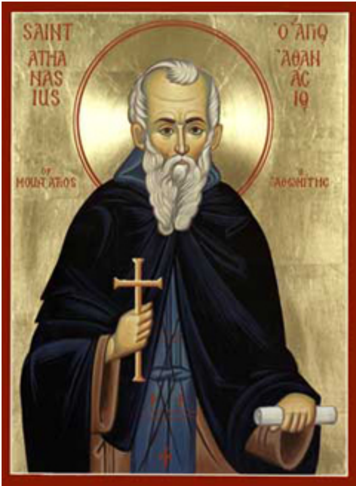
Athanasius of Athos